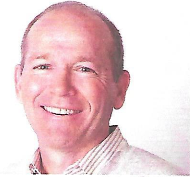
David Calhoun '79

In a powerful statement on the need to reimagine higher education for today's complex world, David Calhoun '79, senior managing director for Blackstone and former CEO of Nielsen, has made the largest-ever gift to Virginia Tech's Honors College.